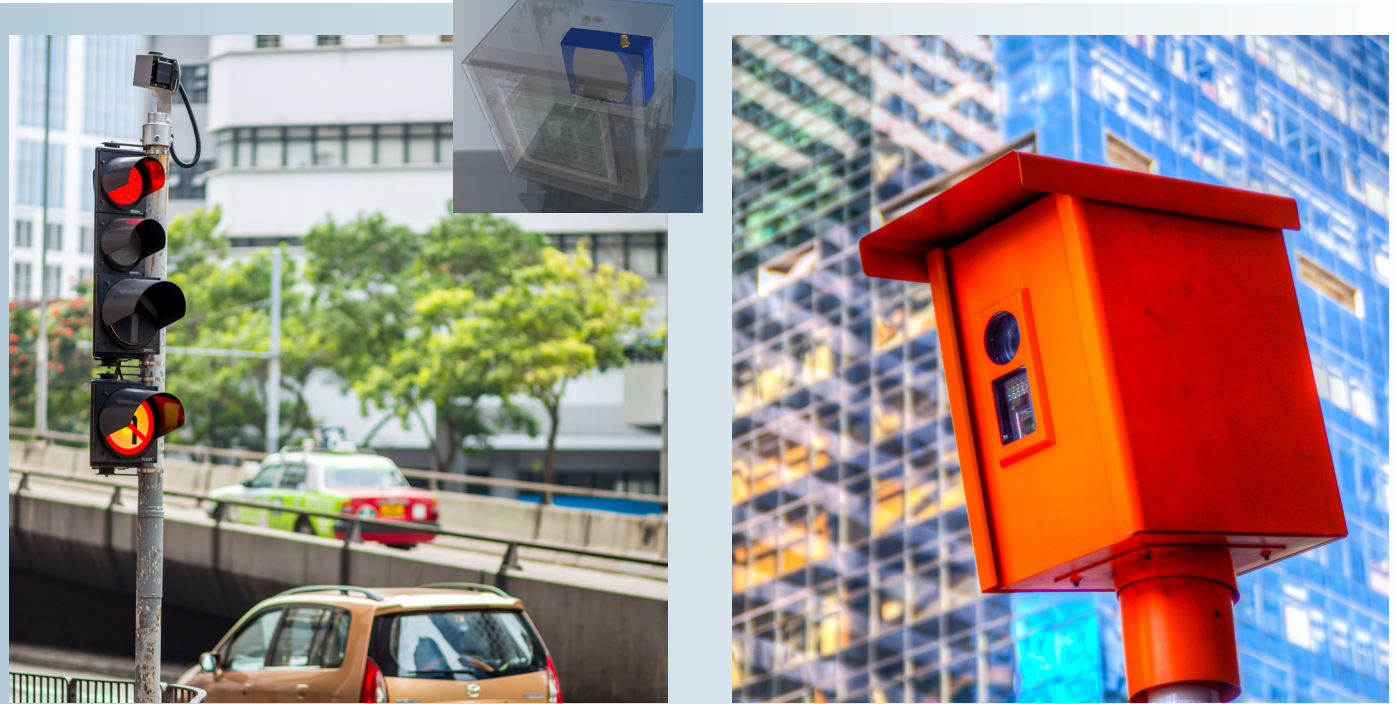
Wireless CAN communication