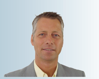
"The CANblue II was the only wireless solution that could handle the 60 meters we needed."

Lowered costs for the end customer — no need for digging down a cable.