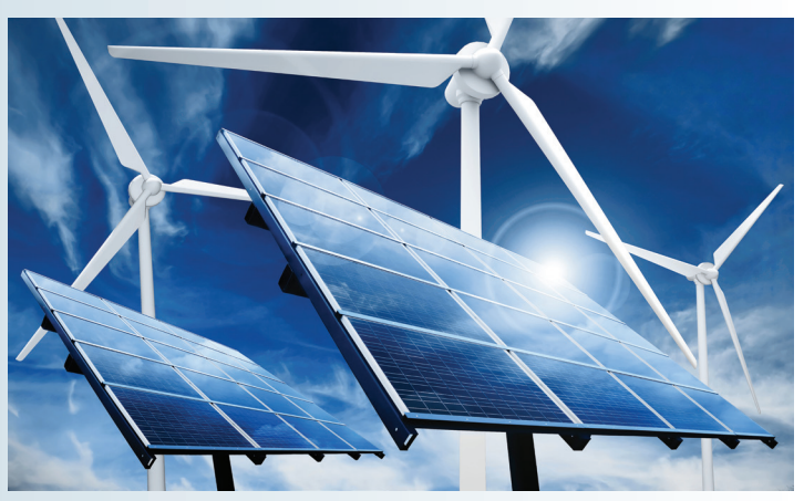
Solar installations is a major market for Super B batteries, as is hybrid marine and service vehicles

"The IXXAT protocol software stacks were especially well-suited for this project as they enable very quick re-connect-times, " says Kurt van Buul, Project Manager for the Super B project at Twincomm. "The batteries are always on, even if they are not